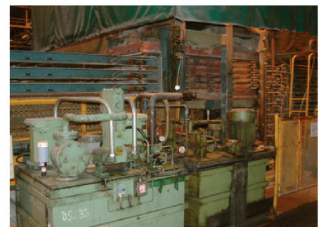
Photo 1 - Press section of wall partitioning area.

After careful consideration of the losses and anticipated problems it was decided to implement a Major Kaizen project. This type of problem solving methodology is extremely structured, and thorough. It incorporates a step approach learning model which enables the client to embed the knowledge gained and replicate its application in other 'loss' areas of the factory. The project relied on in house knowledge and expertise, due to the original supplier no longer being available. A wide range of personnel was required, from operators and technicians, through to supervisors and engineers. Once the team had been established one of the first actions was to review and where appropriate improve the data quality from the process. Once a robust phenomena was understood. The team set about using the Focused Improvement methodology to understand the systems, principles and parameters of this process.