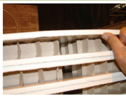
Photo - 2 The quality phenomena the project team investigated. It clearly shows the de-lamination between the board and corrugated section.